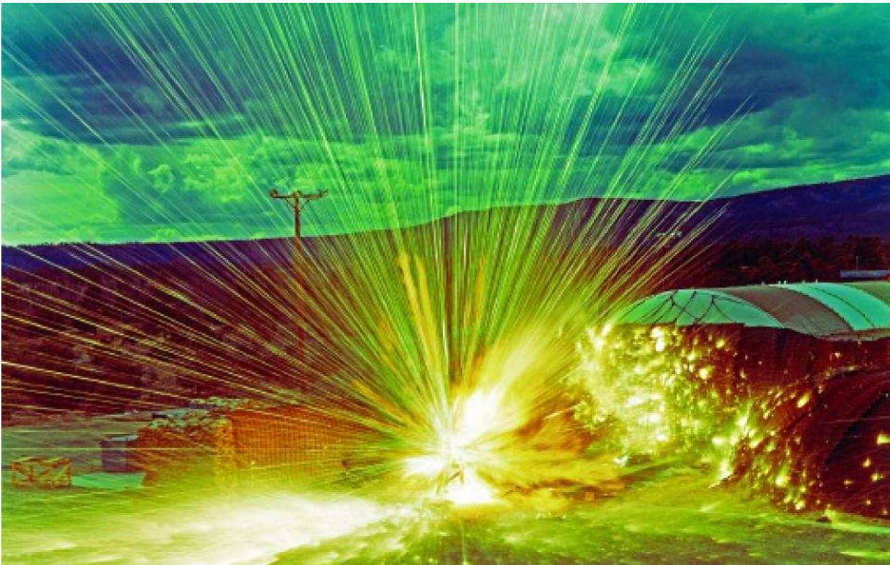
Phermex hydrotest at Los Alamos National Laboratory, USA. A test of a modified atomic bomb throws out super-hot depleted uranium.