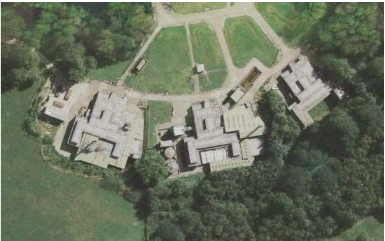
Current hydrodynamics test facilities at AWE Aldermaston, showing two giant 'Mogul' flash x-ray machines on the outside of the test building.