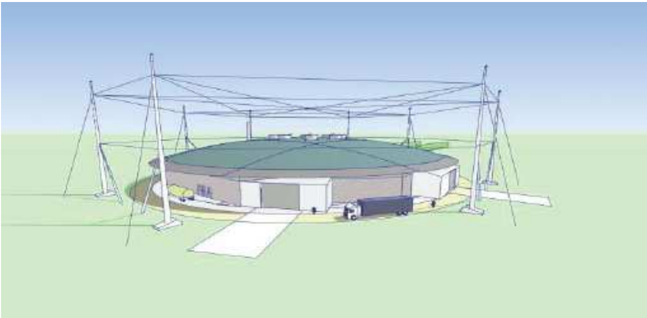
Impression of how the main Project Hydrus building will look.