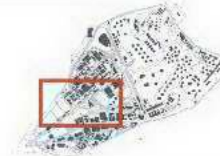
Overview Showing Extent Of Main Map

This document is of United Kingdom origin and contains proprietary information which is the property of the Secretary of State for Defence. It is furnished in confidence and may not be copied, used or disclosed in whole or in part without prior written consent of the Intellectual Property Rights Group IPR/pt.1, Ministry of Defence, Abbeywood Bristol BS34 6JH, England