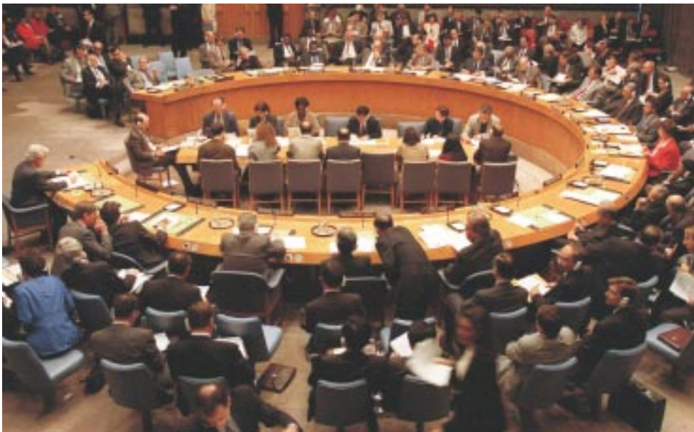
Members of the Security Council meet at the United Nations

69. Countering terrorism abroad: the UN Security Council's Counter-Terrorism Committee, chaired by the UK, is assessing all countries' compliance with UNSCR 1373, which imposes obligations on all states to suppress terrorist financing and deny terrorists safe havens in which to operate.