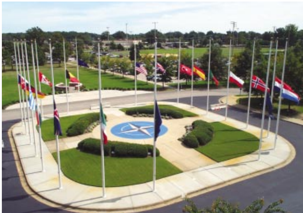
The National Flags at NATO Headquarters, flying at half mast after 11 September

72. Key to success will be the continued development of modern and effective Alliance military capabilities, the creation of more flexible command structures (with the focus on deployable headquarters) and the implementation of a new force structure capable of generating, deploying and sustaining NATO forces wherever they are needed. Also important will be the exploitation of NATO's strategic partnerships, particularly with the EU and Russia – but also through Partnership for Peace and NATO's Mediterranean Dialogue.