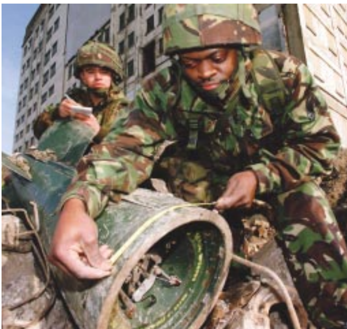
Experts from 101 (London) Engineer Regiment (Explosive Ordnance Disposal) (Volunteers), practice dealing with an unexploded bomb

83. We have now developed some proposals (summarised in the Box below and set out in more detail in the discussion document we published on 12 June) to form Reaction Forces from the Volunteer Reserves for home defence and security purposes. The discussion document sought views on these proposals from the Reserves, their employers and others with an interest, by 13 September. Once we have gathered these views, we will refine our proposals as necessary and begin implementation as quickly as possible. We aim to have an initial Reaction Force capability in place before the end of the year and then to build up to full capability as soon as possible thereafter, as we purchase the necessary equipment and provided the additional training.