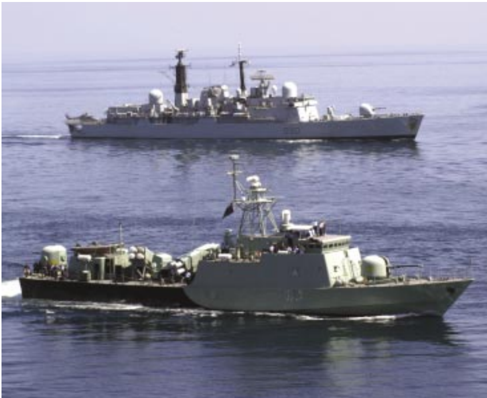
HMS Southampton exercising with an Omani patrol vessel during Saif Sareea II