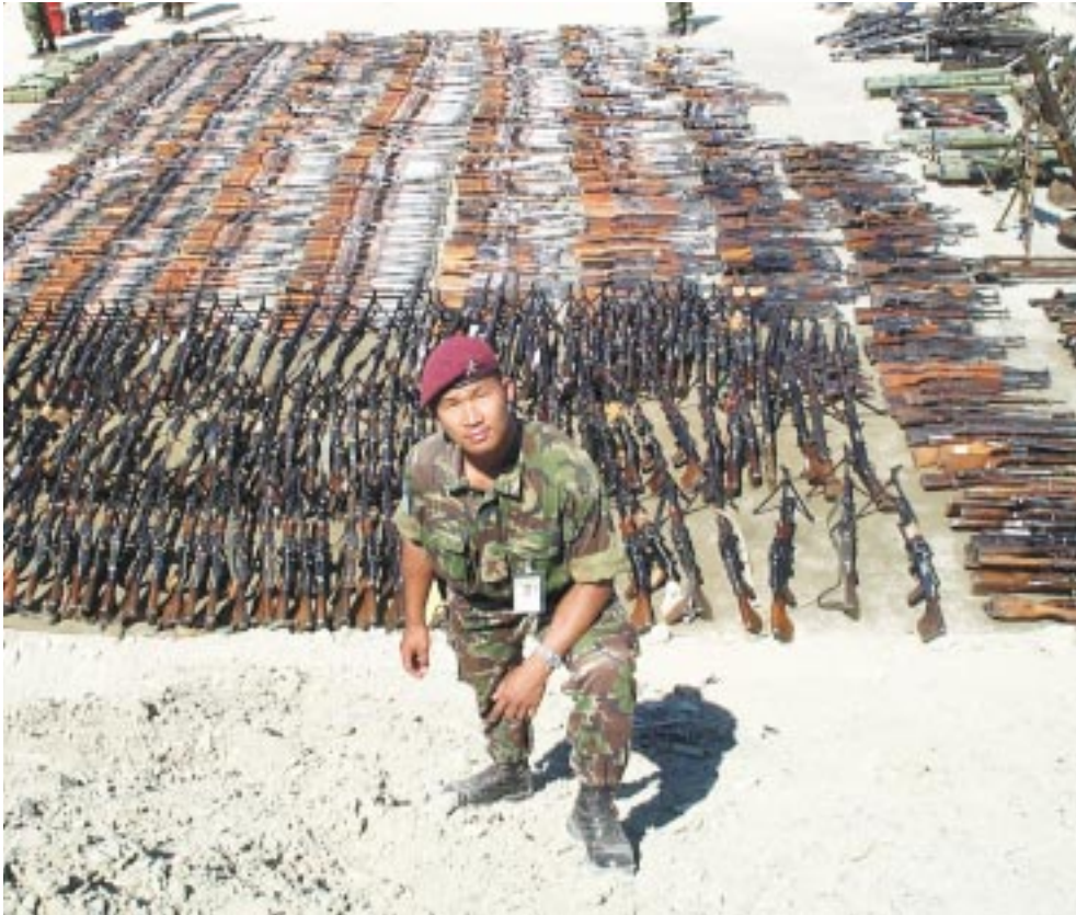
A Gurkha Corporal seen with some of the large numbers of weapons successfully collected by NATO in Macedonia

18. For example, in 2002 the Government is funding a major programme of initiatives of security sector reform in Afghanistan. The MOD will offer its expertise for a wide range of activities to be carried out with Afghan and international partners, and in co-ordination with the United Nations Assistance Mission in Afghanistan.