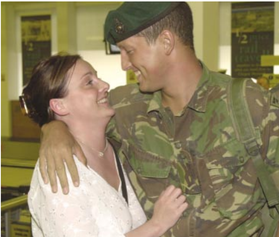
A Royal Marine welcomed home from Afghanistan by his wife at Prestwick

57. We have to accept, though, that we still face considerable challenges in this area. Most importantly, despite significant efforts and some notable successes in the area of recruiting and retention, fully manned and sustainable manpower structures are proving elusive. It is not simply a