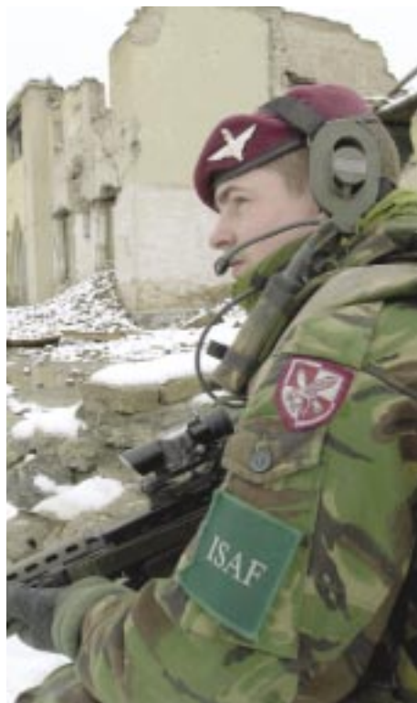
The Parachute Regiment on a security patrol in the centre of Kabul

19. Our defence diplomacy activities have a key role to play. For example, our provision of training to other countries has already proved its worth in terms of improving the effectiveness and interoperability of other nations' forces – including the forces of countries at risk from terrorism – and is also a highly effective component in contributing to building long term relationships. In future, in determining our relative priorities in defence relations with other countries, we will want to give higher priority than hitherto to the potential demands of operations to counter terrorism, and the potential for particular countries to be partners, and to provide support.