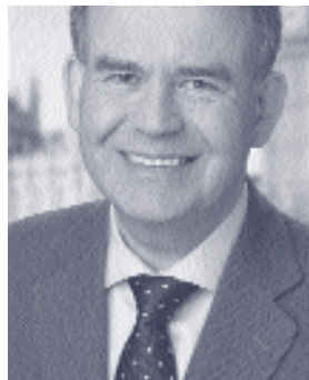
Dr. Julian Lewis MP Shadow Defence Minister for nuclear deterrence and Naval Affairs

Dr. Julian Lewis argues that retaining Trident is ethically justifiable if possession helps to prevent a future conflict between nuclear powers.