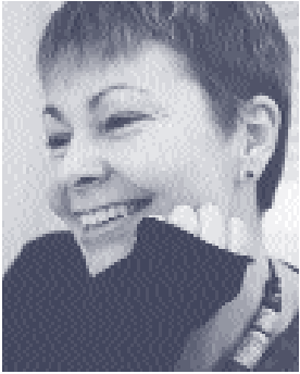
Dr. Caroline Lucas MEP Principal Speaker for the Green Party

Dr. Caroline Lucas argues that to relinquish Trident would strengthen the Nuclear Non-proliferation Treaty, reassert the nuclear taboo, and de-link the UK's foreign policy from the Whitehouse.