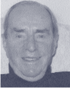
Admiral Sir Raymond Lygo KCB former Chief of the Naval Staff; and former CEO, British Aerospace

Sir Raymond Lygo argues that nuclear deterrence is a prudent insurance policy in a world where future threats are real and uncertain; and deterrence is militarily preferable to waging war.