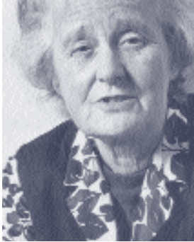
Mary Midgley D.Litt (Dunelm), professional philosopher and author

Mary Midgley argues that the exceptionally indiscriminate nature of nuclear weapons makes them ethically unjustifiable, and that the causes of conflicts are knowable and can be addressed directly.