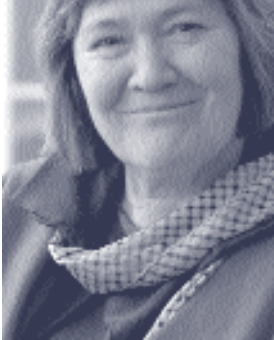
Rt. Hon. Clare Short MP former Secretary of State for International Development (1997 – May 2003)

Rt. Hon. Clare Short argues that an intelligent decision regarding Trident cannot be made without public and parliamentary debate about Britain's international role in the world.