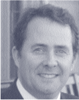
Dr. Liam Fox MP Shadow Secretary of State for Defence

Dr. Liam Fox argues that without a fundamental revolution in the behaviour of mankind the risk of nuclear blackmail will continue to exist, therefore the UK needs the power of nuclear deterrence.