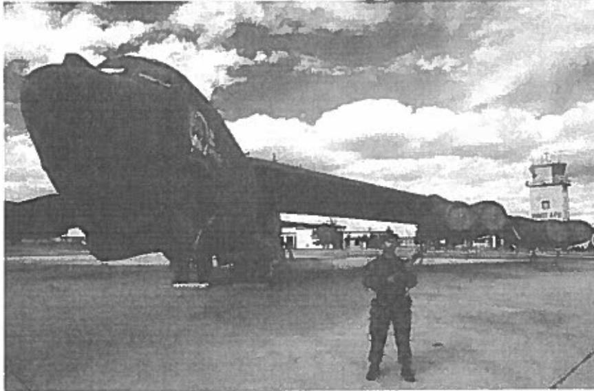
Security forces protect nuclear weapons and delivery systems.

until an authorized code has been entered. They may also involve personnel monitoring systems, such as the Personnel Reliability Program or the Two-Person Concept. Commanders are responsible for ensuring that appropriate systems are in place, as described by appropriate Air Force policies.