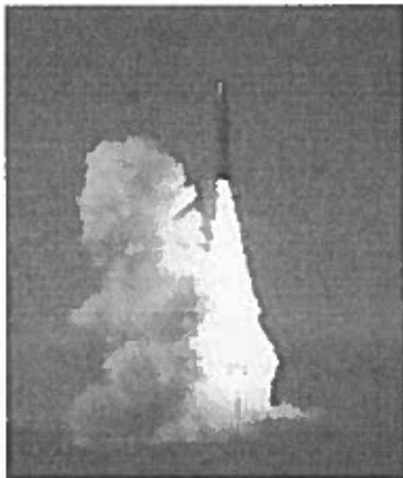
ICBMs offer rapid targeting and execution.

There are three global delivery platforms for nuclear weapons: intercontinental ballistic missiles (ICBMs), bombers, and submarine-launched ballistic missiles (SLBMs). They are maintained by the US Air Force and Navy, while their nuclear operational use is controlled by US Strategic Command (USSTRATCOM). Each has its advantages and limitations. By maintaining the Triad of forces, the limitations of each are balanced by the other systems and their vulnerability to attack is lessened. ICBMs, bombers, and SLBMs comprise a system that allows for a nuclear option regardless of the method of attack used by an enemy.