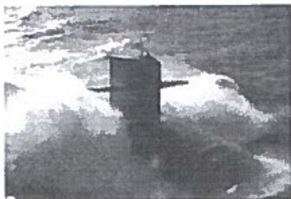
Once they submerge, submarines are hidden from enemy eyes.

served by a potential enemy and serve as notice that the United States is prepared to respond to an attack. Tanker aircraft, many of which are flown by the Air Reserve Component (ARC), provide bombers both extended range and the flexibility to be redirected and hold a variety of targets at risk, including mobile targets. However, the time required for them to reach their targets can limit their effectiveness. In addition, they are "soft" targets and are vulnerable on the ground, which means that tactical warning is essential if they are to remain a viable option. Dispersing the bomber and tanker force to other airfields or assuming an airborne alert posture can enhance survivability.