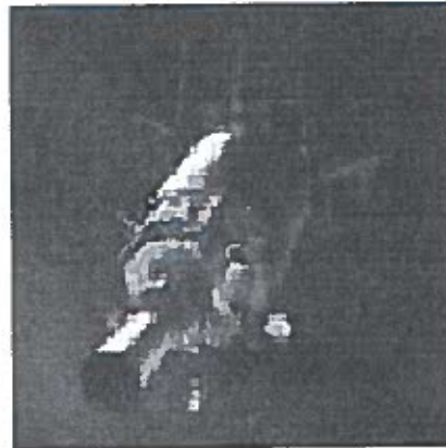
Defense Support Program satellites provide early warning of a missile attack.

Proper use of ISR assets is critical to the planning, conduct, and assessment of nuclear operations. ISR affords the commander the ability to gather information and make decisions in a timely fashion. Warning systems must be in place that allow civilian leaders to determine if a nuclear response is appropriate. Planners must have the means of finding decisive targets and determining the proper weapon to employ. Post-attack assessment of both friendly and enemy capabilities is essential for determining the need for and ability to conduct follow-on attacks.