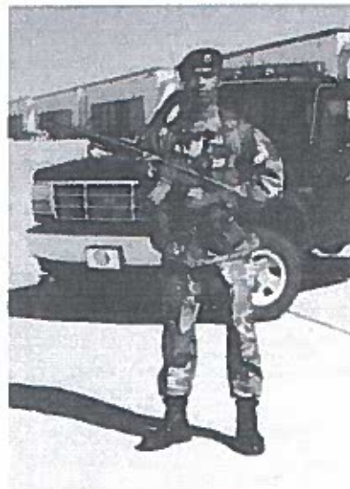
Proper security is essential for maintaining WSSRs.

WSSRs are implemented through a combination of mechanical means, security procedures, flying rules, and personnel programs. Different weapon systems will have different rules based on their capabilities. Storage and movement of weapons must also be consistent with WSSRs. Commanders and operators must follow applicable Air Force policies for their weapon system and must ensure that non-US personnel adhere to applicable Air Force and multinational requirements. One key component of WSSRs is that, while preventing the unauthorized use of nuclear weapons, they allow for timely employment when ordered. To this end, all personnel involved in the com-