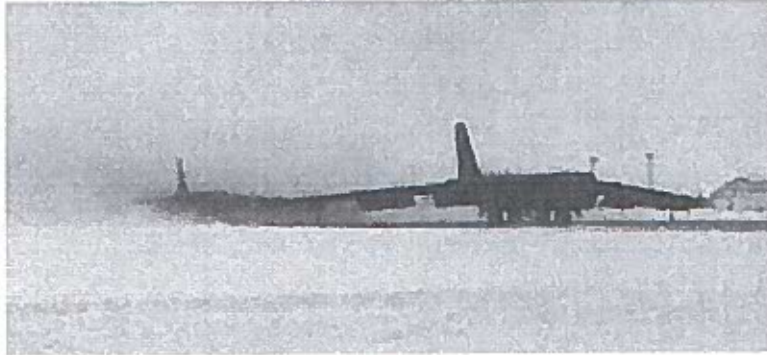
B-52s perform minimum interval takeoffs in response to tactical warning.

possible that communications may be degraded to the point that it is difficult to pass critical information or send orders to the field.