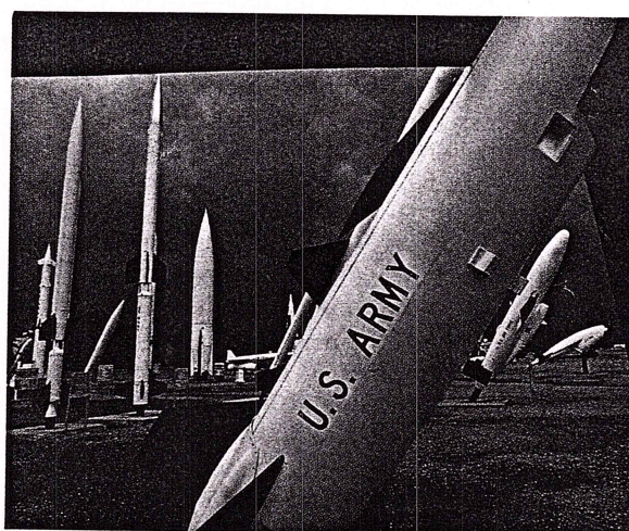
US nuclear rocket

Over time, planning was increasingly distanced and ultimately disconnected from any sense of scientific or military reality. In the end, the nuclear powers, great and small, created astronomically expen-