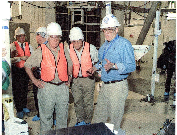
Congressman Dave Hobson, chairman of the House Energy and Water Development Appropriations Subcommittee, and Congressman Mike Simpson, subcommittee member, tour the target chamber in the National Ignition Facility at Lawrence Livermore National Laboratory.