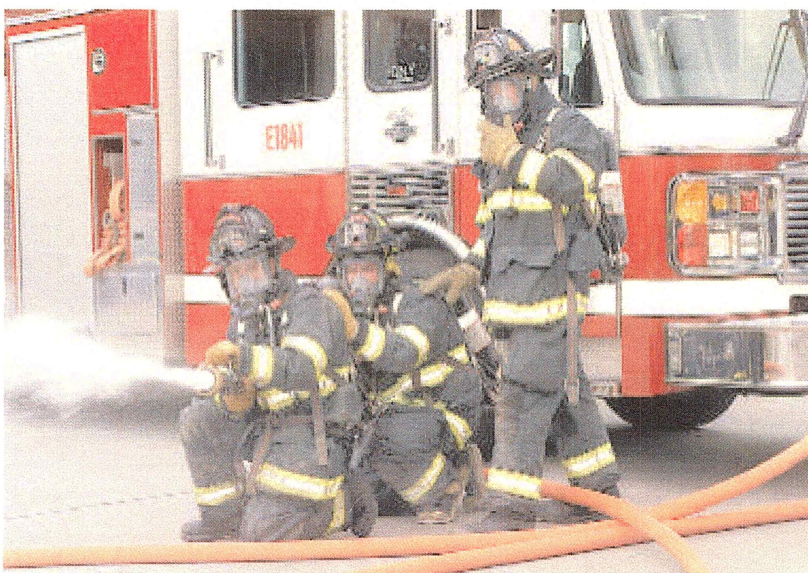
LLNL firefighters, seen here during a training exercise, recently returned from Southern California, where they were dispatched to help fight the recent wildfires. A crew of Bechtel Nevada firefighters also provided assistance at the Cedar fire outside San Diego.

The overall SNS budget is $1.4 billion. Oak Ridge National Laboratory is leading the effort, and Los Alamos' share of the work totals about $200 million.