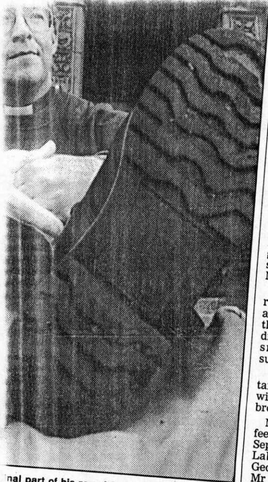
nal part of his round-Scotland sponsored walk, Dunfermline, in aid of the Scottish Episcopal Ministry of the Church, walked about 520 miles

...teachers who were meeting in Cardiff.