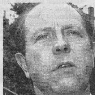
Archie Hamilton: Meeting West of Scotland MPs today

Foulkes, the Carrick, Cumnock and Doon Valley MP who is a vice president of the Clyde Fishermen's Association, will also be taking part in the talks with the minister. He said: "We want an immediate assessment of the value of the Clyde scheme,