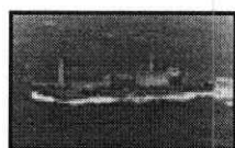
Photo: The tanker "Amur" dumping liquid radioactive waste in the Barents Sea . gif, 105K, jpg, 23K

The tanker Amur is a radiological auxiliary vessel put into use by the Northern Fleet. The Amur has cleansing facilities for radioactive cooling water from submarines. The cooling water is then dumped in the ocean. After the Amur was put into service and 975 tons of radioactive cooling water. [13]