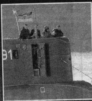
We're sunk . . . U12 arrives